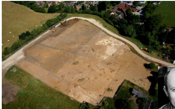
Carl Champness: Wallingford, Winterbrook: Excavations of a multi-period site with Prehistoric and Early Saxon settlement

We're not just about fieldwork – our lectures last year: